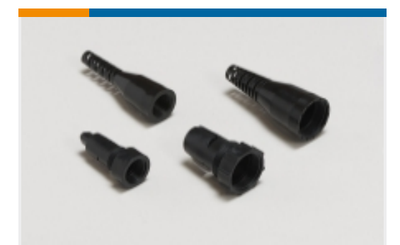
Connector Strain Relief(5)