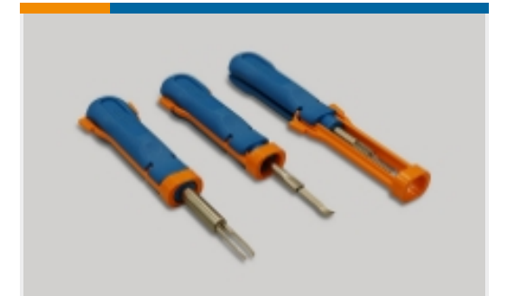
Insertion & Extraction Tools(11)