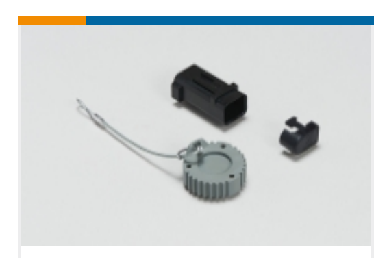
Automotive Connector Caps & Covers (32)