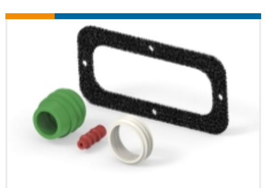
Connector Seals & Cavity Plugs(10)