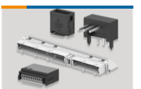
PCB Headers & Receptacles(1)