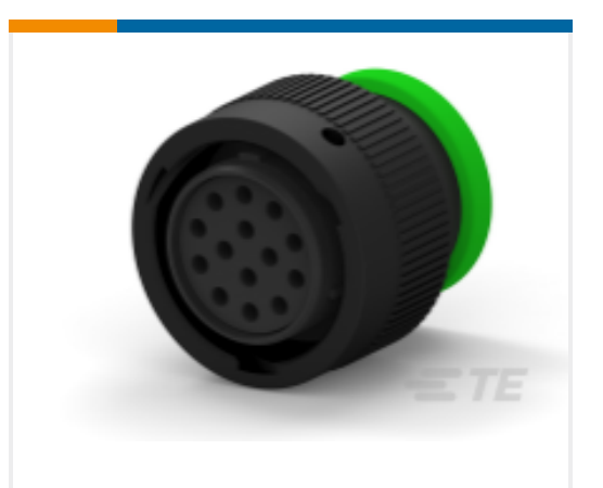
TE Part #HDP26-18-14SN-L017 PLG, 14P, BLK, N, RNG, 16, S