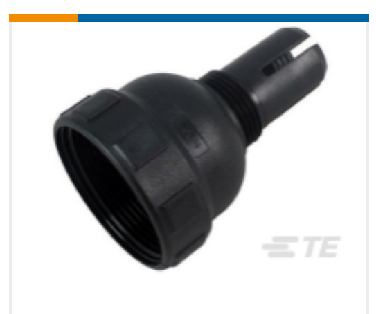
TE Part #M902-2192 BKSHL, 9SZ, CBL SZ .300-.430, HD10