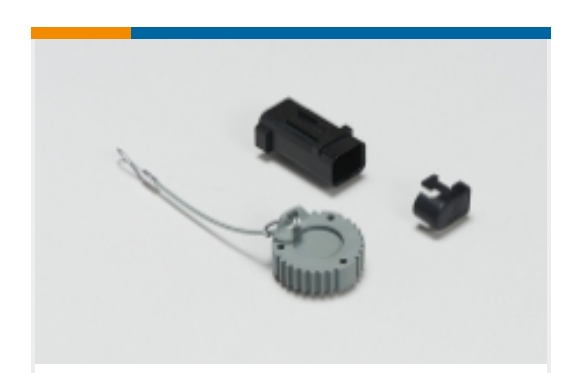
Automotive Connector Caps & Covers (17)