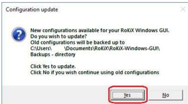
Figure 1. Configuration update pop-up window