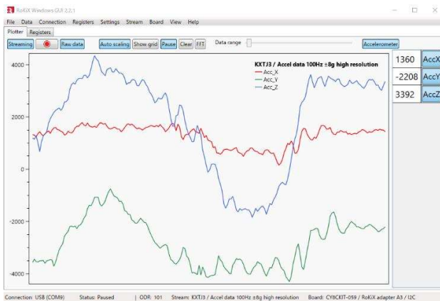
Figure 3. Example RoKiX Windows GUI software window