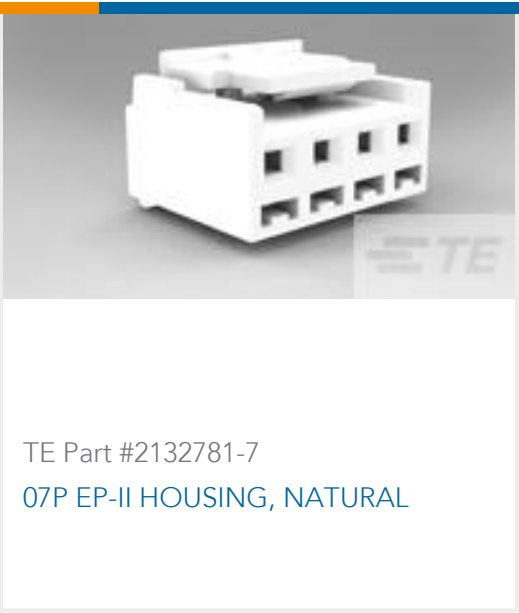
TE Part #2132781-7 07P EP-II HOUSING, NATURAL