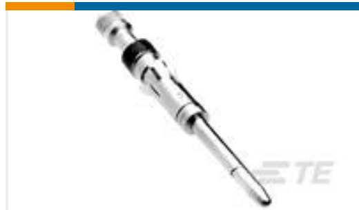
TE Part #202507-1 CONTACT PIN ASSY.