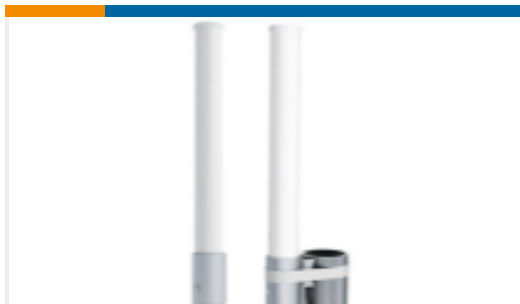
TE Part #OC69271-FNF OMNI,DBAND,FIXED,NF 698-960MHz, 1.5dBi