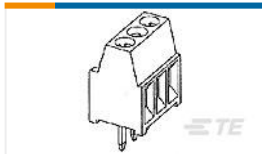
TE Part #1-282834-2 TERMI-BLOK PCB MOUNT, 90 12P.