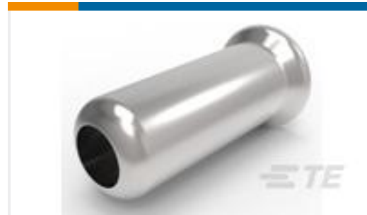
TE Part #1-50871-8 SOCKET,MIN-SPR W/H AU SER-5