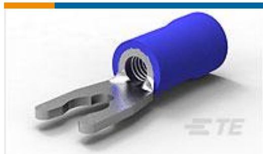
TE Part #52955 TERMINAL,PG SPR SPD 16-14 6