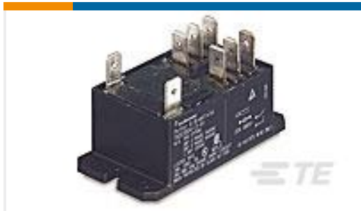
TE Part #6-1393211-2 T92P7A22-240