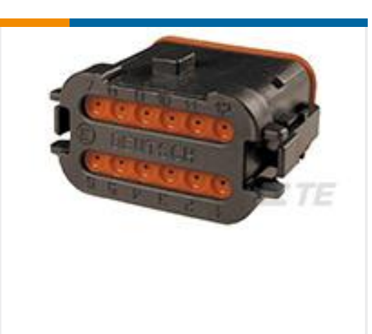
TE Part #DT06-12SB-CE05 PLG, 12P, BLK, E, SEAL RET,ENH KEY, CAP,B