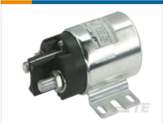
TE Part #K1060259 Relay 29-511-12