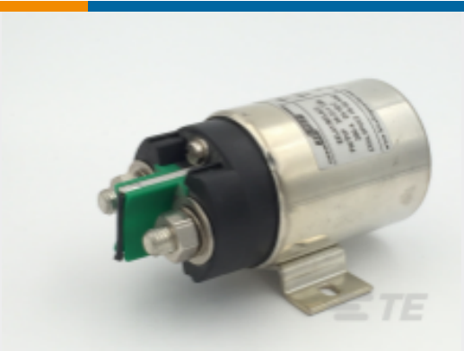
TE Part #K1021410 Relay 29-211-12