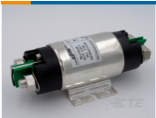
TE Part # CAT-AL6-KSPR29300 Power Relay, 300A, Standard, Monostable, DC

numbers that TE has identified as EU ELV compliant have a maximum concentration of 0.1% by weight in homogenous materials for lead, hexavalent chromium, and mercury, and 0.01% for cadmium, or qualify for an exemption to these limits as defined in the Annexes of Directive 2000/53/EC (ELV). Regarding the REACH Regulation, the information TE provides on SVHC in articles for this part number is based on the latest European Chemicals Agency (ECHA) ‘Guidance on requirements for substances in articles’ posted at this URL: https://echa.europa.eu/guidance-documents/guidance-on-reach