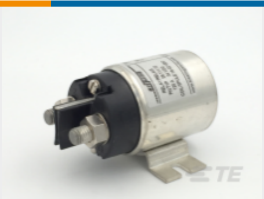
TE Part #K1060028 Relay 29-111-12