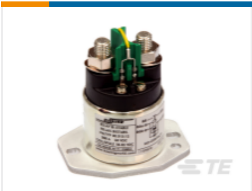
TE Part # CAT-AL6-KSPR30300 Power Relay, 300A, Standard, Bistable, 2 Coils, Polarized