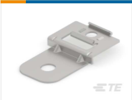
TE Part #1027-017-1200 CLIP, STEEL, ZINC, 8.2MM HOLE, SIDE