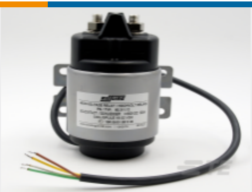
TE Part # K1153839 Relay (HVR) 60-311-12