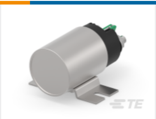
TE Part # K1023465 Relay 29-314-12-903