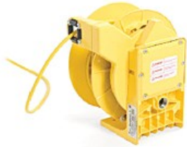
Series image - Reference only

CORD REEL-INDUTRIAL DUTY #AM095105204WIT