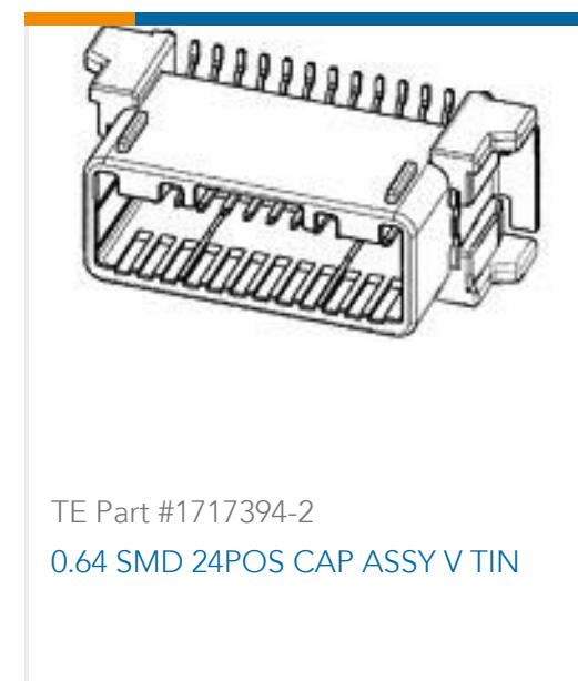
TE Part #1717394-2 0.64 SMD 24POS CAP ASSY V TIN