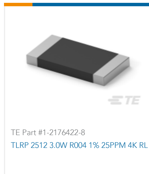
TE Part #1-2176422-8 TLRP 2512 3.0W R004 1% 25PPM 4K RL