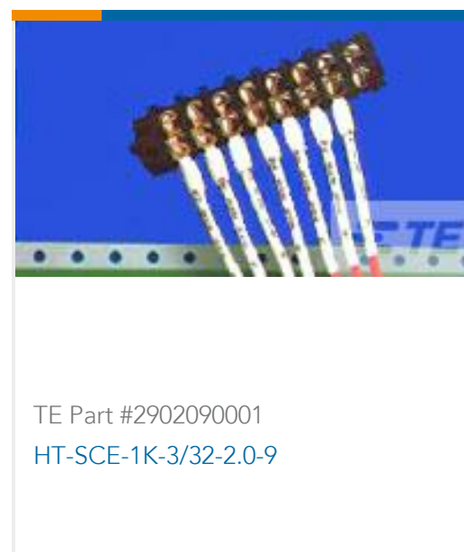
TE Part #2902090001 HT-SCE-1K-3/32-2.0-9