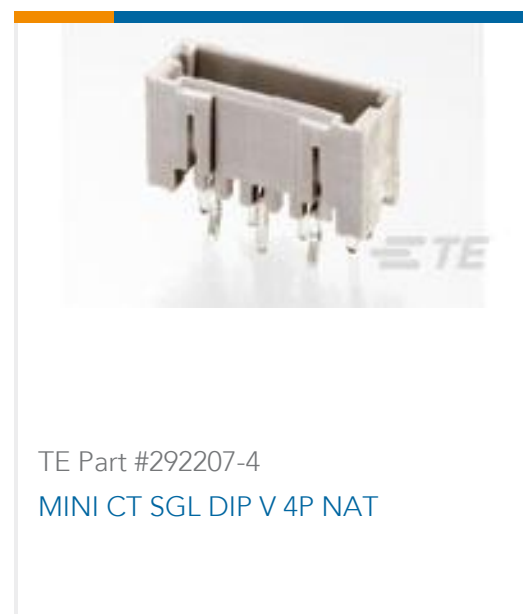
TE Part #292207-4 MINI CT SGL DIP V 4P NAT