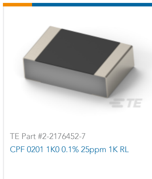
TE Part #2-2176452-7 CPF 0201 1K0 0.1% 25ppm 1K RL