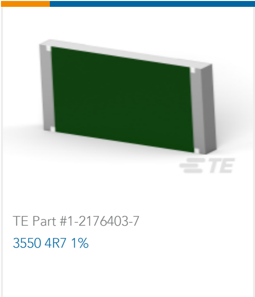
TE Part #1-2176403-7 3550 4R7 1%