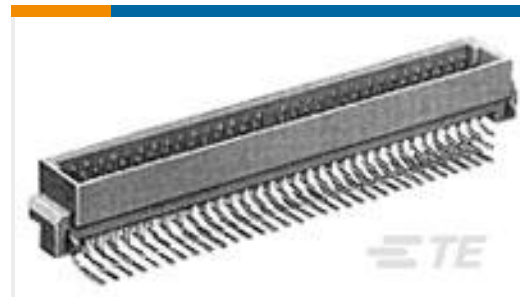
TE Part # 5650916-5 ASSY, PIN, EUROCARD, TYPE C/2, LEA