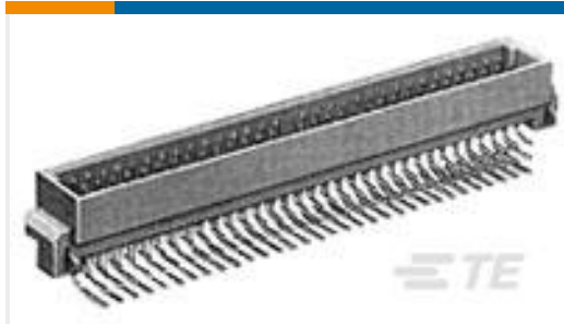
TE Part # 536407-5 048 EURO TYPE C PIN BL ASSY