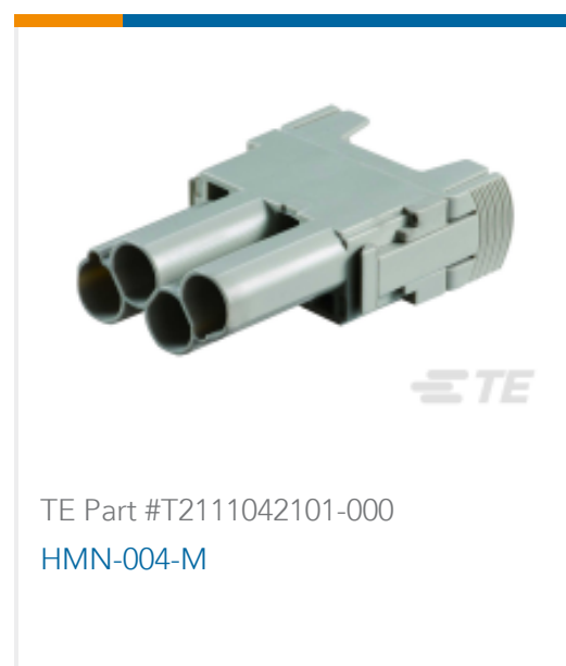
TE Part #T2111042101-000 HMN-004-M