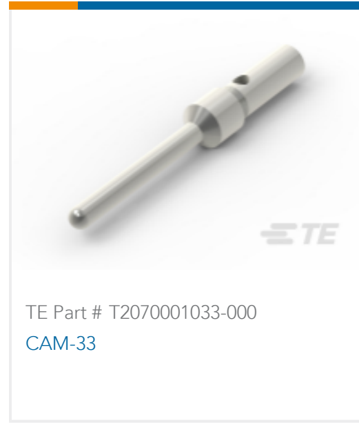
TE Part # T2070001033-000 CAM-33