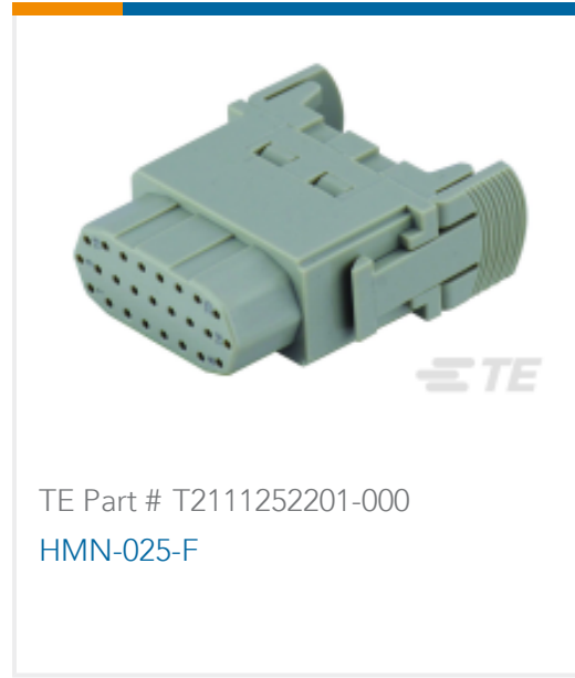
TE Part # T2111252201-000 HMN-025-F