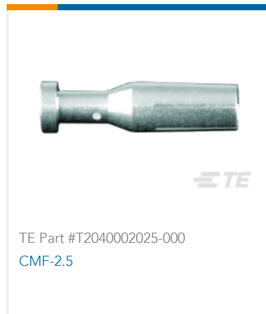
TE Part #T2040002025-000 CMF-2.5