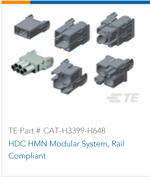
TE Part # CAT-H3399-H648 HDC HMN Modular System, Rail Compliant