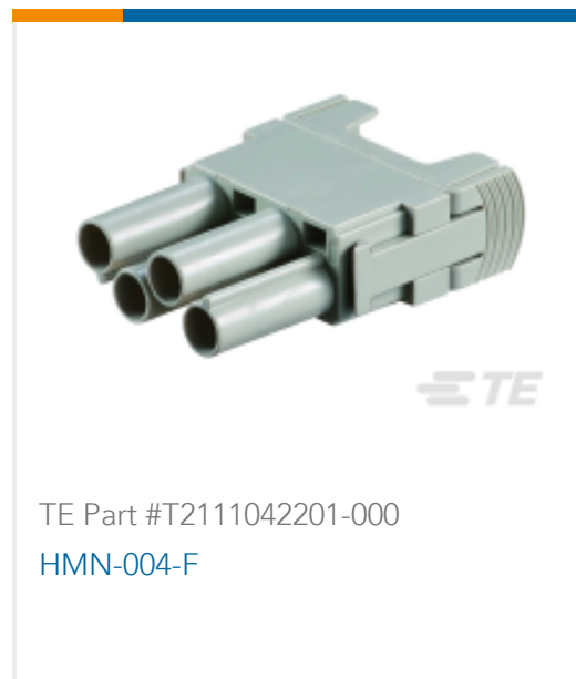
TE Part #T2111042201-000 HMN-004-F