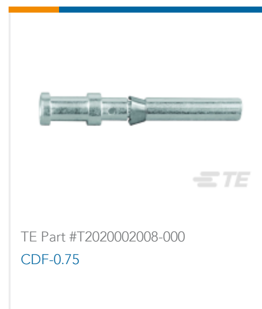
TE Part #T2020002008-000 CDF-0.75