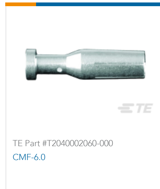
TE Part #T2040002060-000 CMF-6.0