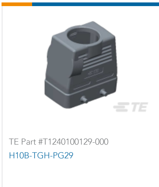
TE Part #T1240100129-000 H10B-TGH-PG29