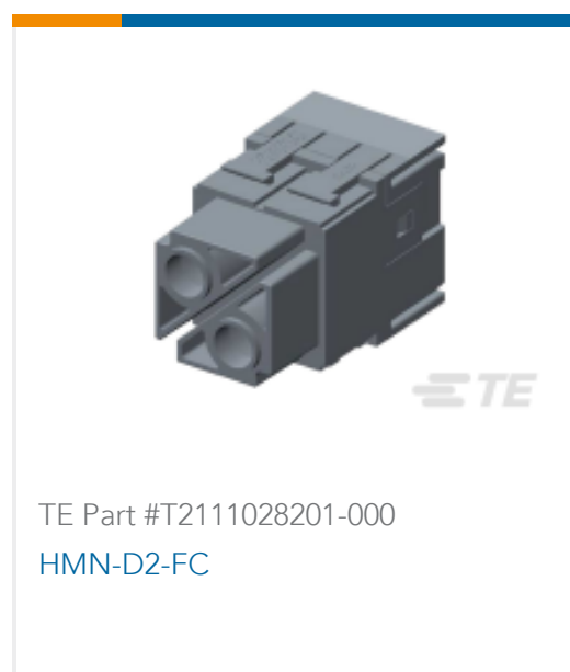
TE Part #T2111028201-000 HMN-D2-FC