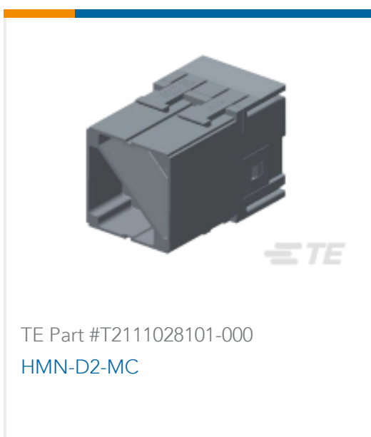
TE Part #T2111028101-000 HMN-D2-MC