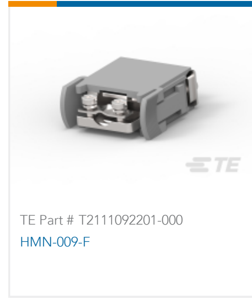
TE Part # T2111092201-000 HMN-009-F