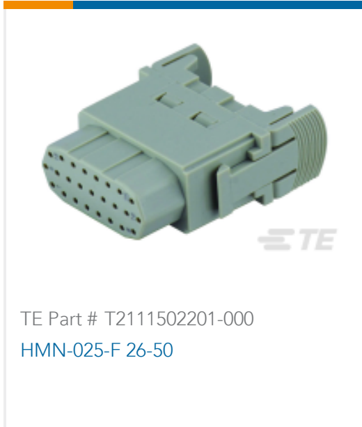
TE Part # T2111502201-000 HMN-025-F 26-50