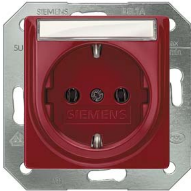
DELTA i-system red SCHUKO socket outlet 10/16 A 250 V With screwless Connection terminals with labeling field cover plate 55 x 55 mm