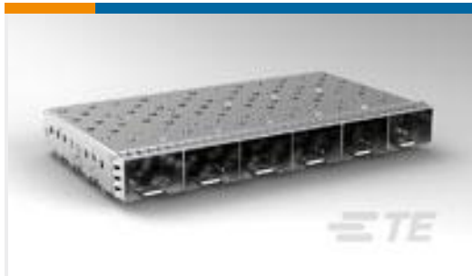
TE Part #2007251-1 SFP+ 1x6 Cage Assembly