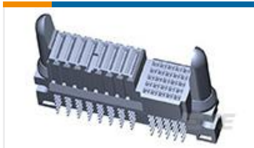
TE Part #2-1926739-5 AssyMinipak Hdl25s10pRARecptSc