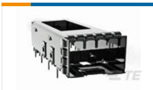
TE Part #2007198-2 SFP+ 1x1 Cage Assembly, Press-Fit