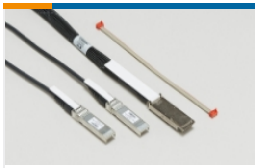
Pluggable I/O Cable Assemblies(13)