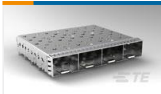
TE Part #2149730-1 SFP+ 1x4 Cage, Heatsinks and Lightpipes