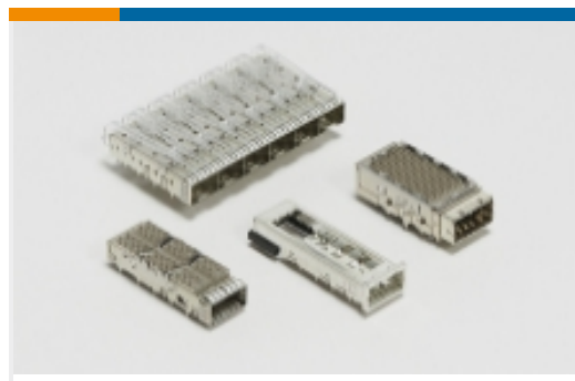
Pluggable IO Connectors & Cages(154)