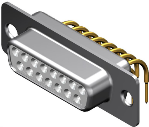
Illustration only. The pole size may deviate from the image.

Part Number : 1731090591 Product Description : FCT Standard-Density D-Sub Connector, Female, Right-Angle, PCB Through Hole, 11.10mm Tail Length, Gold Plating, 200 Mating Cycles, 37 Circuits, White Insulator Series Number : 173109 Status : Active Product Category : D-Sub Connectors Engineering Number : F37S5G2