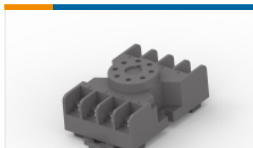
TE Part #2-1419106-3 27E891=SOCKET, KRPA, 8, OCTAL, POL