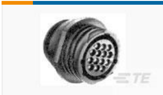
TE Part #206043-3 17-14 CPC REC FREE HANGING