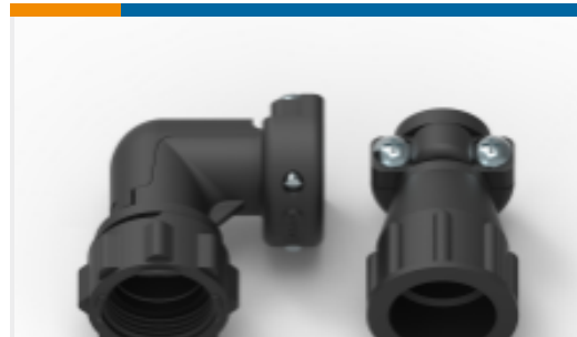
TE Part #206322-9 CPC Cable Clamps