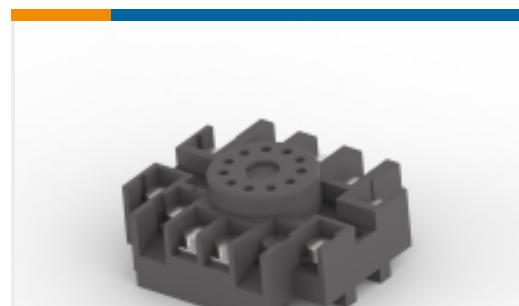
TE Part #2-1419106-4 27E892=SOCKET, KRPA, 11, OCTAL, PO