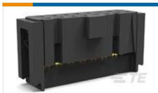
TE Part #1658527-7 622-1641LF FEM SOCKET, LEAD FREE