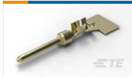
TE Part #66506-9 PIN CONTACT, 20 DF