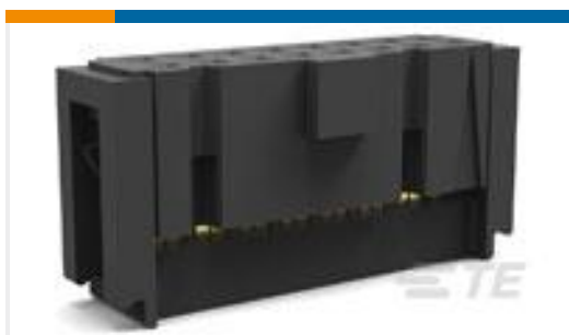
TE Part #1-1658527-0 622-2641LF FEM SOCKET, LEAD FREE