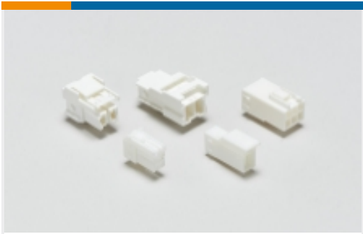
Rectangular Power Connectors(46)