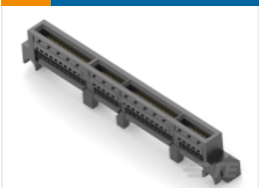
TE Part #2340321-1 ASSY STRADDLE MOUNT 168P 062 SLIVER 2.0