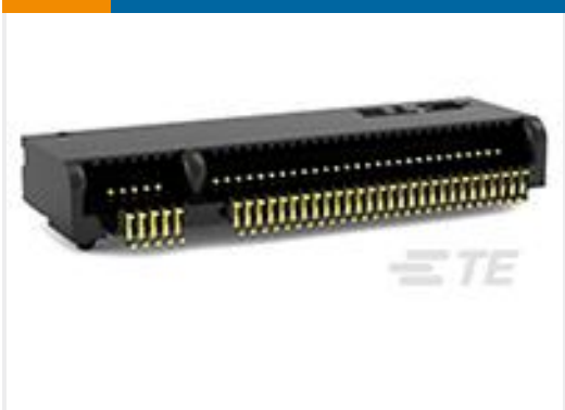
TE Part #1-2199119-5 M.2 0.5PITCH 3.2H KEY M 15U" AU