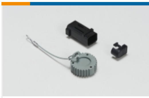
Automotive Connector Caps & Covers (19)