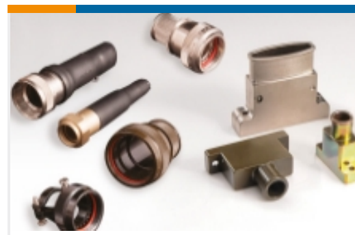
Connector Backshells (61)