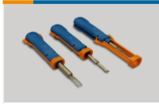
Insertion & Extraction Tools (3)