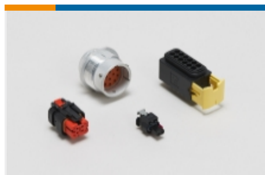
Automotive Housings (104)