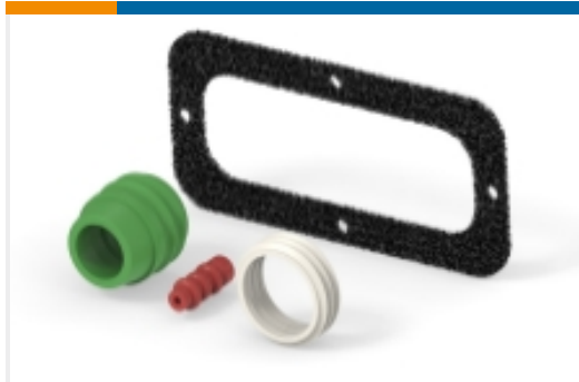
Connector Seals & Cavity Plugs (6)