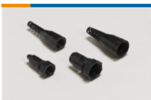
Connector Strain Relief (28)