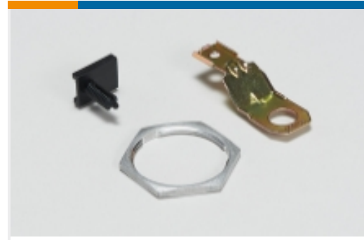
Other Automotive Connector Accessories (28)