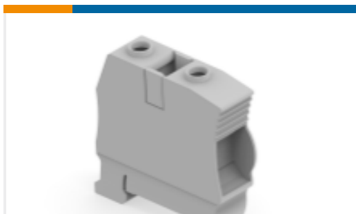
TE Part #1SNK516010R0000 ZS35