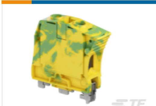
TE Part #1SNK516150R0000 ZS35-PE