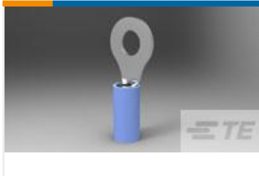
TE Part #321045 TERMINAL,PIDG R 16-14 1/4