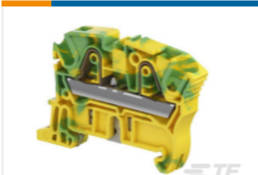
TE Part #1SNK708150R0000 ZK6-PE