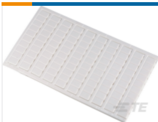
TE Part #1SNK160031R0000 MC812PA 21->30 (x10) Horizontal