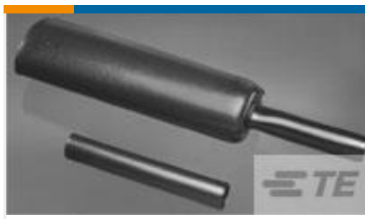
TE Part #166916-000 RMW-63/19-1200/ADH-0