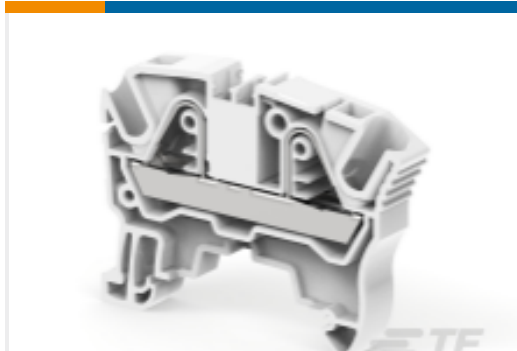
TE Part #1SNK708010R0000 ZK6