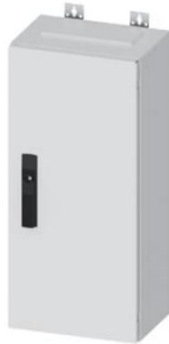
ALPHA 400, wall-mounted cabinet, Flat Pack, IP43, Protection class 1, H: 650 mm, W: 300 mm, T: 210 mm, RAL 9016