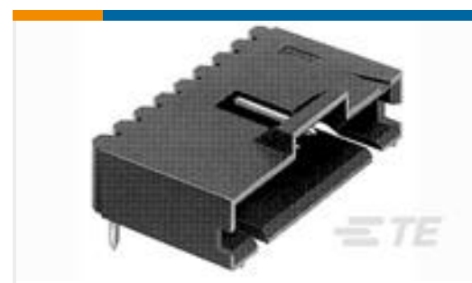
TE Part #5-104935-6 05 MTE HDR SRRA LTCH.100CL LF