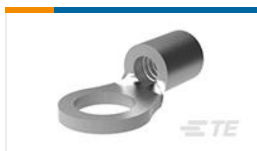
TE Part #8-34104-1 SOLIS R 22-16 COMM 22-18 MIL 4