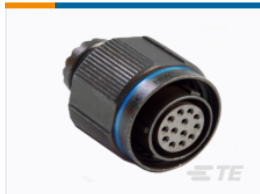
TE Part #YDTS26W13-98SNV001 PLUG ASSY