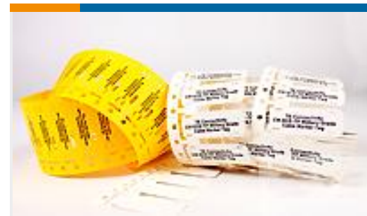
TE Part #A83925-000 CM-SCE-TP-1/2-6H-9