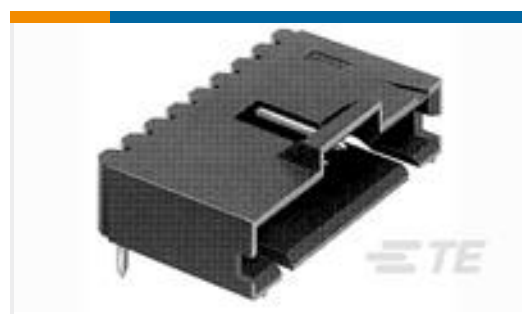
TE Part #5-104935-7 06 MTE HDR SRRA LTCH.100CL LF