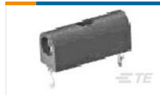
TE Part #3-582118-9 TEST PROBE REC130 BI WHT GPBR