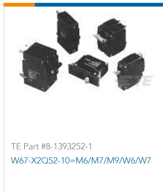
TE Part #8-1393252-1 W67-X2Q52-10=M6/M7/M9/W6/W7