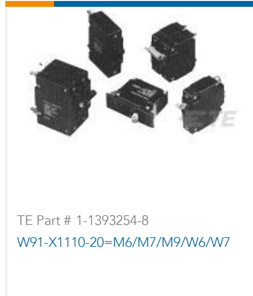
TE Part # 1-1393254-8 W91-X1110-20=M6/M7/M9/W6/W7