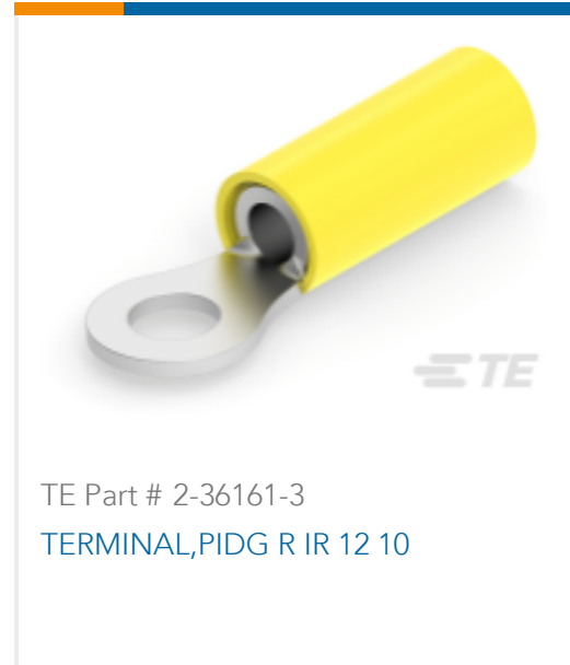
TE Part # 2-36161-3 TERMINAL,PIDG R IR 12 10