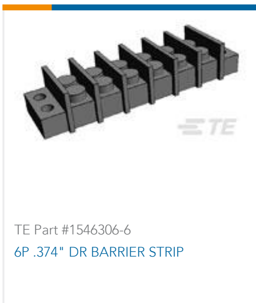
TE Part #1546306-6 6P .374" DR BARRIER STRIP