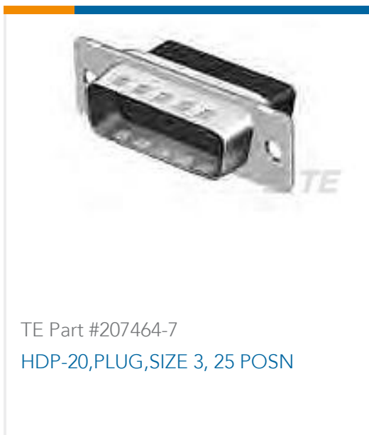
TE Part #207464-7 HDP-20,PLUG,SIZE 3, 25 POSN