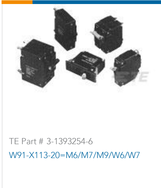
TE Part # 3-1393254-6 W91-X113-20=M6/M7/M9/W6/W7