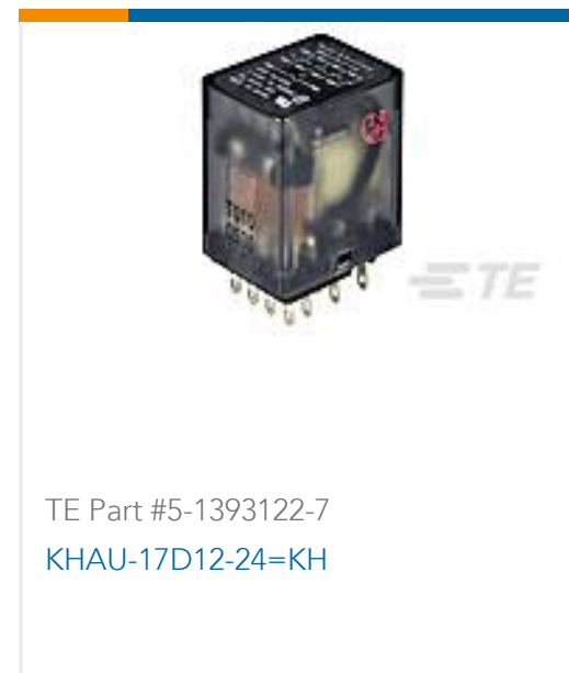
TE Part #5-1393122-7 KHAU-17D12-24=KH