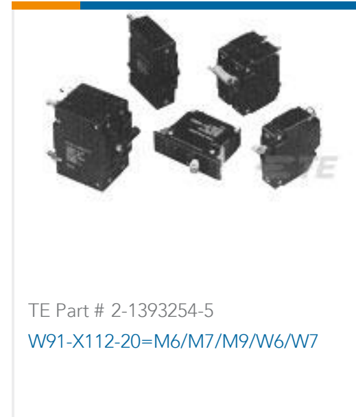
TE Part # 2-1393254-5 W91-X112-20=M6/M7/M9/W6/W7