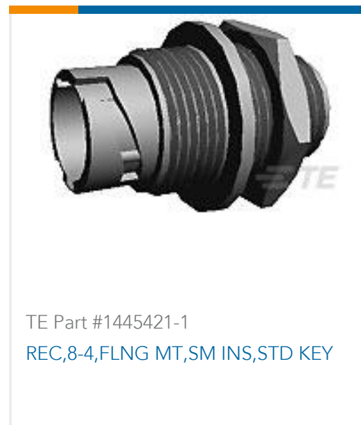
TE Part #1445421-1 REC,8-4,FLNG MT,SM INS,STD KEY