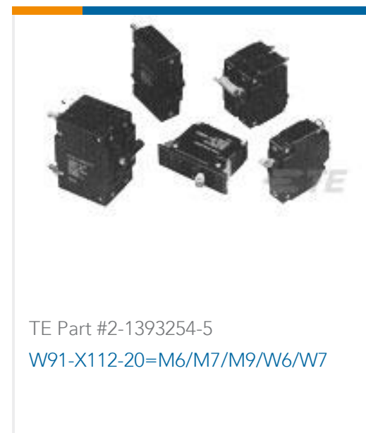
TE Part #2-1393254-5 W91-X112-20=M6/M7/M9/W6/W7