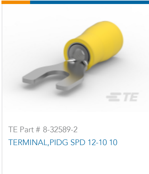
TE Part # 8-32589-2 TERMINAL,PIDG SPD 12-10 10