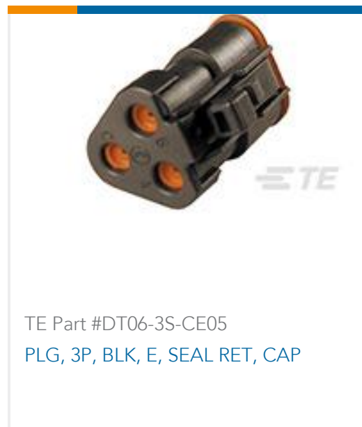
TE Part #DT06-3S-CE05 PLG, 3P, BLK, E, SEAL RET, CAP