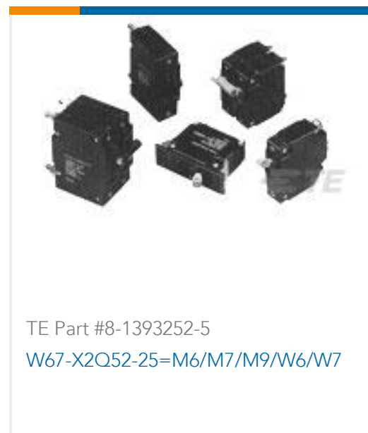
TE Part #8-1393252-5 W67-X2Q52-25=M6/M7/M9/W6/W7