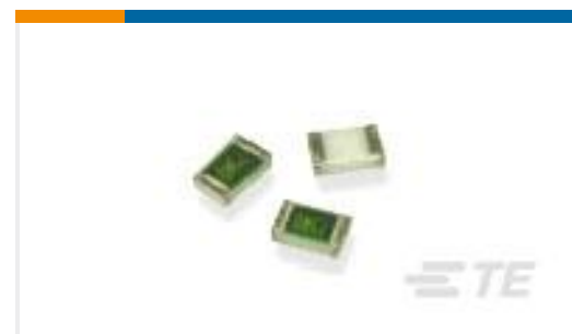
TE Part #1676286-2 RN 0805 2K26 0.1% 10PPM 1KRL