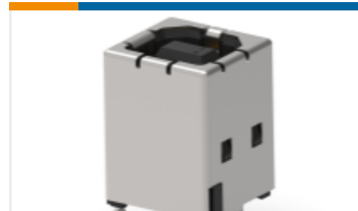
TE Part #5787834-1 STD USB TYPE B, VERTICAL, T/H