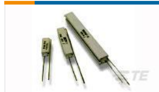
TE Part #1623732-3 BCHE 7 W 10R 5%