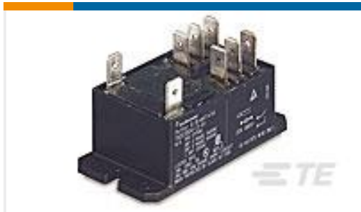
TE Part #5-1393211-3 T92P11D22-12