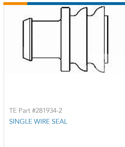
TE Part #281934-2 SINGLE WIRE SEAL