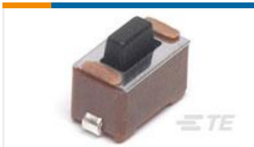
TE Part #147873-1 SWITCH,TACT,SMT,J-LEAD,5.0MM