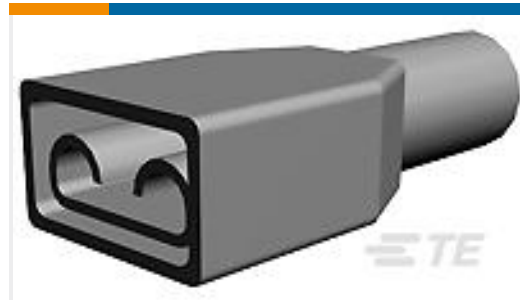
TE Part #735159 250 PIDG FF