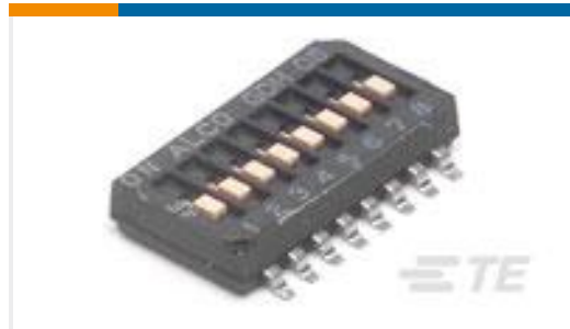
TE Part #1571983-3 GDH02STR04=DIP SWITCH