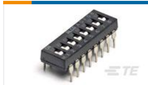
TE Part #1-1825059-3 ADF04S04=DIP SWT,FLUSH,SMT-GW