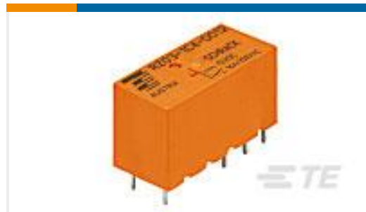
TE Part #2-1415899-2 RZ03-1C4-D012