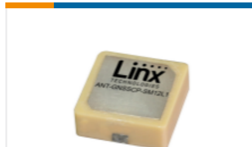
TE Part #ANT-GNSSCP-SM12L1 Antenna GNSS L1 12x12 SMT