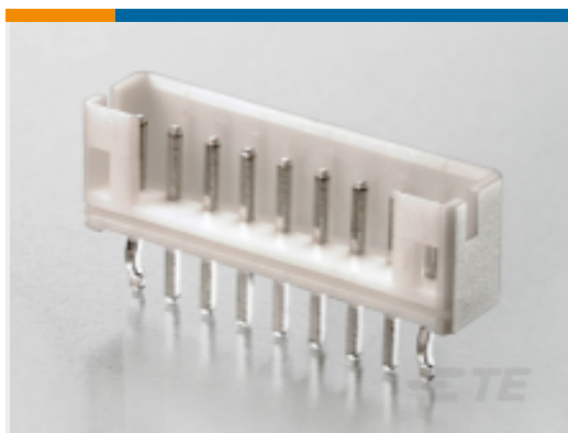
TE Part # CAT-H857-H34225 AMP HPI 2.5 mm Headers