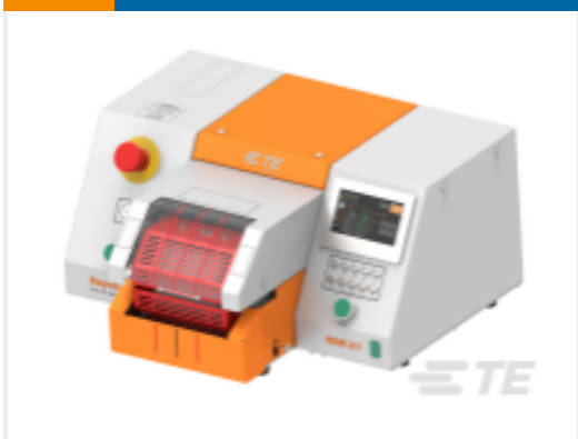
TE Part # 1-2234800-1 RBK-X1, AUTO TRIGGER