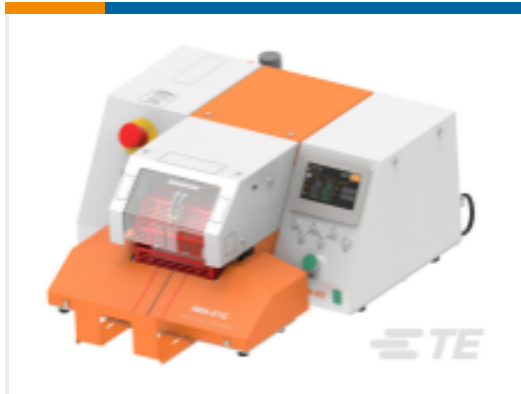
TE Part # 1-2376800-3 RBK-X1C, W/ AIR COOLING