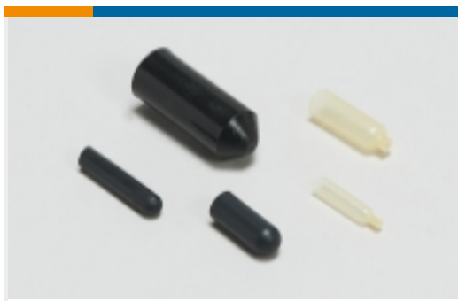
Heat Shrink Caps(40)