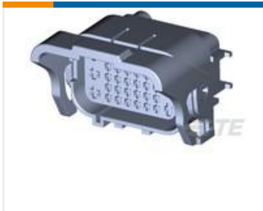
TE Part #1743632-2 HYB SLD 36P PLUG ASSY