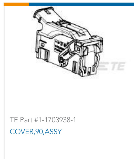
TE Part #1-1703938-1 COVER,90,ASSY