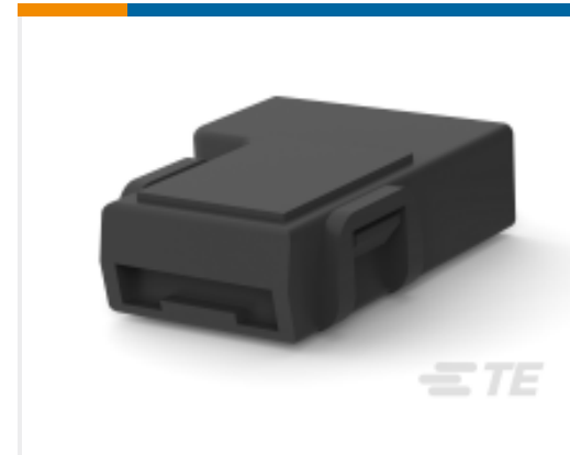
TE Part #180984-5 FASTON 250 BOOT FLAG NYLON BLK