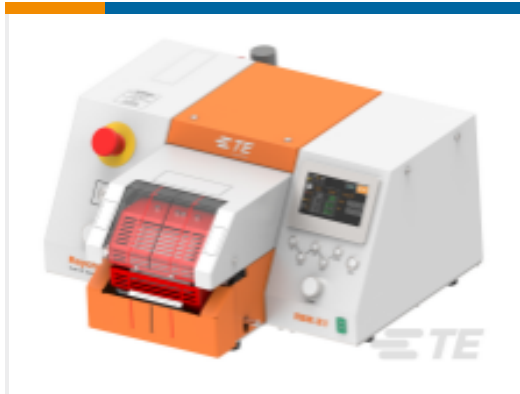
TE Part # 1-2234800-4 RBK-X1 CE, W/ AIR COOLING