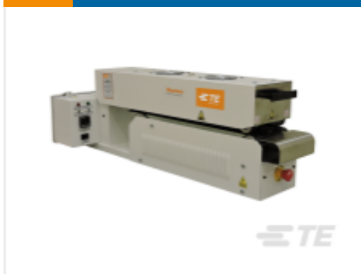
TE Part # 2280355-1 220 V MODEL 17