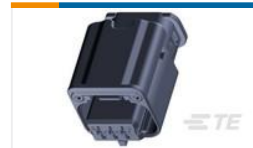
TE Part #1801179-3 3W RECEPTACLE HPSL CONNECTOR GREY