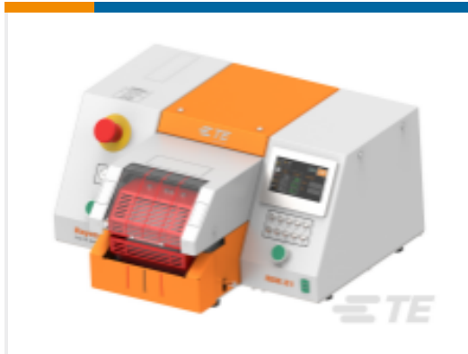
TE Part # 2234800-1 RBK-X1 STD