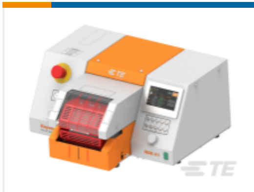
TE Part # 2234800-2 RBK-X1 CE STD