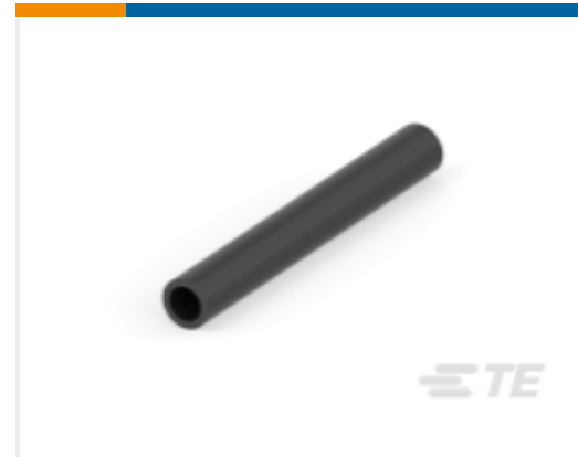
TE Part #EL6595-000 RBK-105-KIT-0105-A0