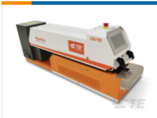
TE Part # 2375320-1 XB19 Belt Heater, STD