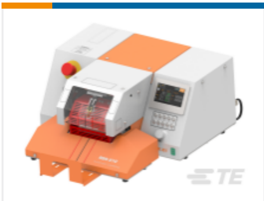
TE Part # 2376800-2 RBK-X1C CE STD