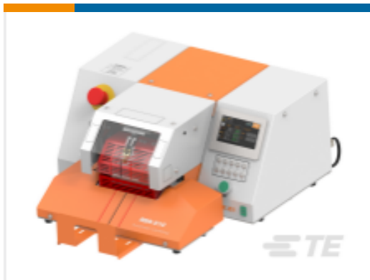
TE Part # 2376800-1 RBK-X1C STD