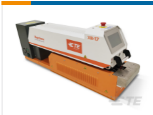
TE Part # 2375310-1 XB17 Belt Heater, 220V