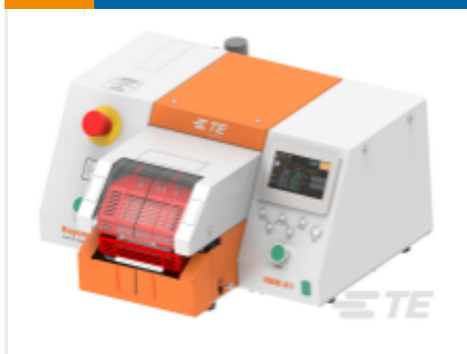
TE Part # 1-2234800-3 RBK-X1, W/ AIR COOLING