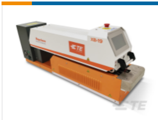
TE Part # 2375320-2 XB19 Belt Heater, 150mm (6'') Version