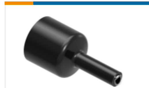
TE Part #NB07596001 HTAT-24/6-0-150MM