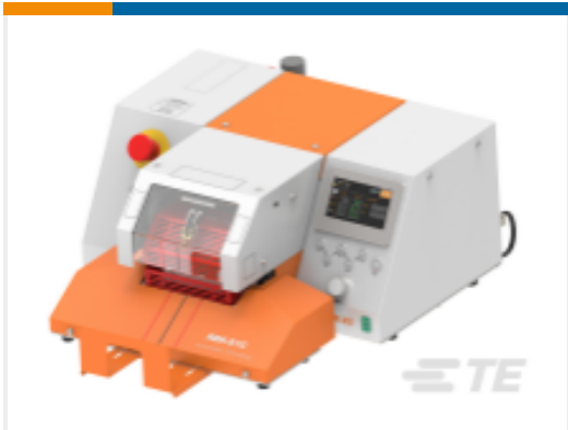
TE Part # 1-2376800-4 RBK-X1C CE, W/ AIR COOLING