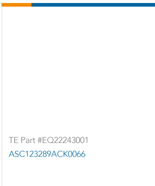
TE Part #EQ22243001 ASC123289ACK0066