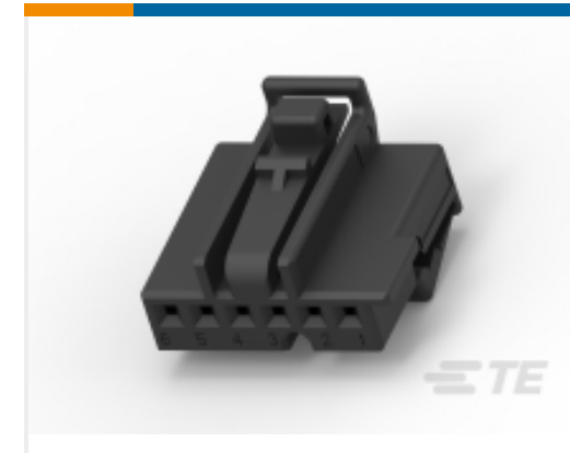
TE Part #1-969508-2 6POS MQS REC COD A