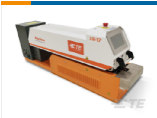
TE Part # 2375310-2 XB17 Belt Heater, 110V