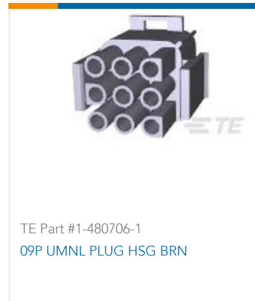
TE Part #1-480706-1 09P UMNL PLUG HSG BRN