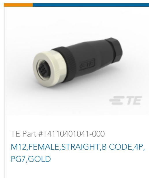
TE Part #T4110401041-000 M12,FEMALE,STRAIGHT,B CODE,4P, PG7,GOLD