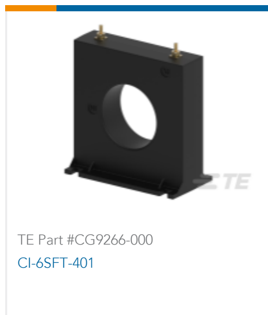
TE Part #CG9266-000 CI-6SFT-401