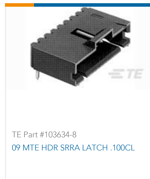
TE Part #103634-8 09 MTE HDR SRRA LATCH .100CL