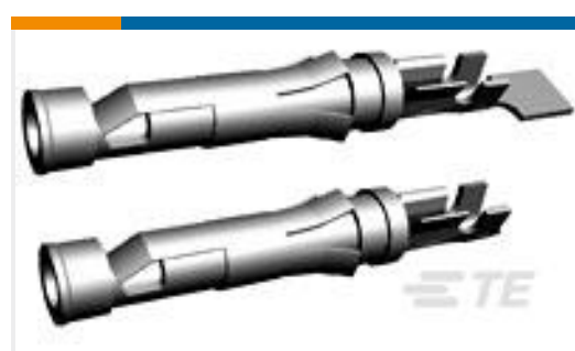
TE Part #66101-3 III+ SKT,18-16,15AU/FL,LP