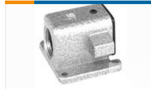
TE Part #1106401-2 EMV-K.3/4.SG.1.M16.G