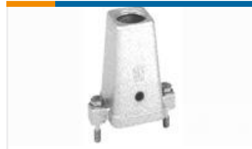
TE Part #1106402-2 EMV-K.3/4.STO.1.M16.G