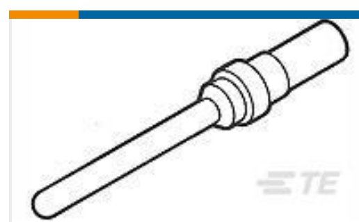
TE Part #205089-2 PIN CONTACT,SZ 20,AMPLIMITE