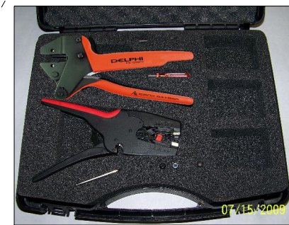
PEW 12, MultiStrip 10 & Carrying Case