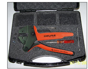
PEW 12 & Carrying Case