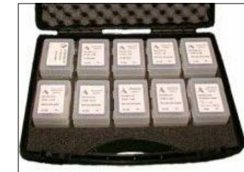
Plastic Carrying Case for 10 Die Set Kits (10 Die Set Kits shown are NOT INCLUDED. Carrying Case is supplied empty.)