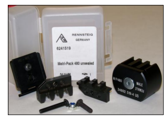
Type 1 Die Set