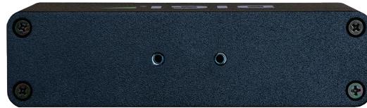
ANYWHEREUSB 2 PLUS BACK