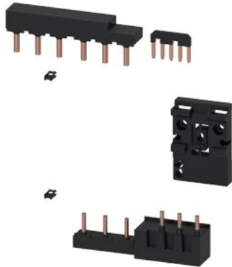
Wiring kit Electrical and mechanical for star-delta S2/S2/S0