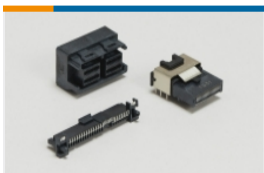
SAS & MiniSAS(10)