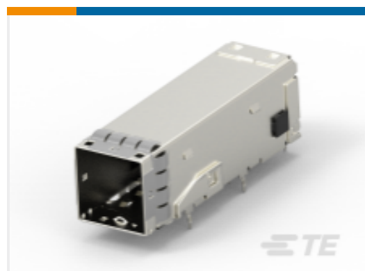
TE Part # 2149027-1 MiniSAS HD 1x1 Rec Assy