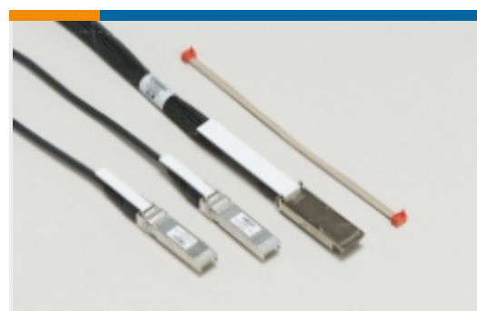
Pluggable I/O Cable Assemblies(18)