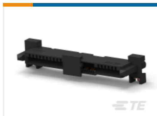
TE Part # 2170563-1 12G SAS RECEPTACLE, 29 POS