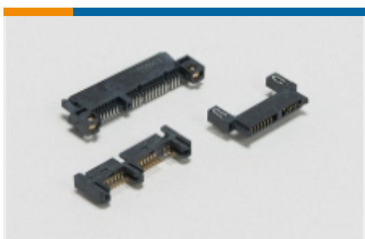
SATA & Micro SATA(1)