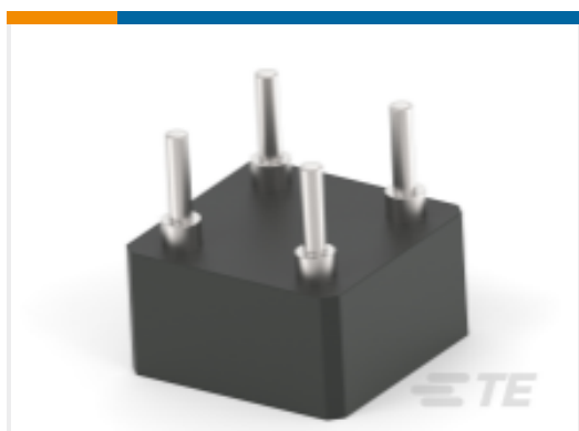
TE Part # 2185275-1 ASY, RMVL TL, SHROUD, MINI-SAS