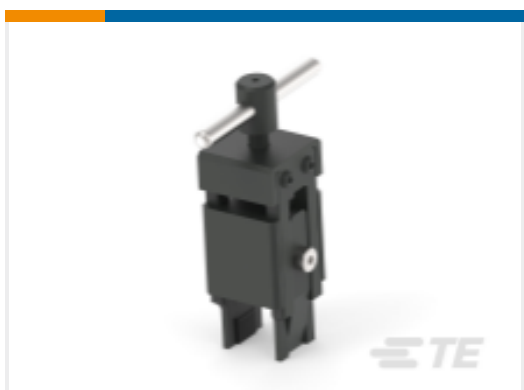
TE Part # 2215044-2 ASSY, REMOVAL TOOL