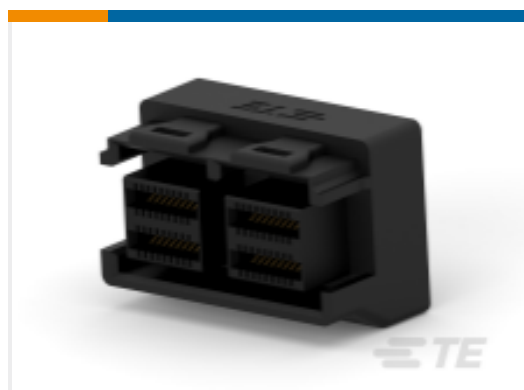
TE Part # 2227640-1 1X2 VERT ASSY, MINI SAS HD INTERNAL