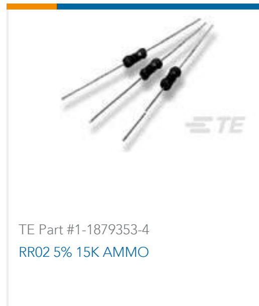
TE Part #1-1879353-4 RR02 5% 15K AMMO