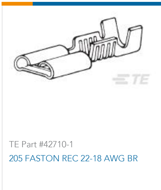
TE Part #42710-1 205 FASTON REC 22-18 AWG BR