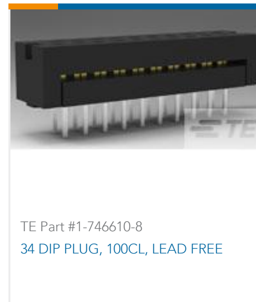
TE Part #1-746610-8 34 DIP PLUG, 100CL, LEAD FREE