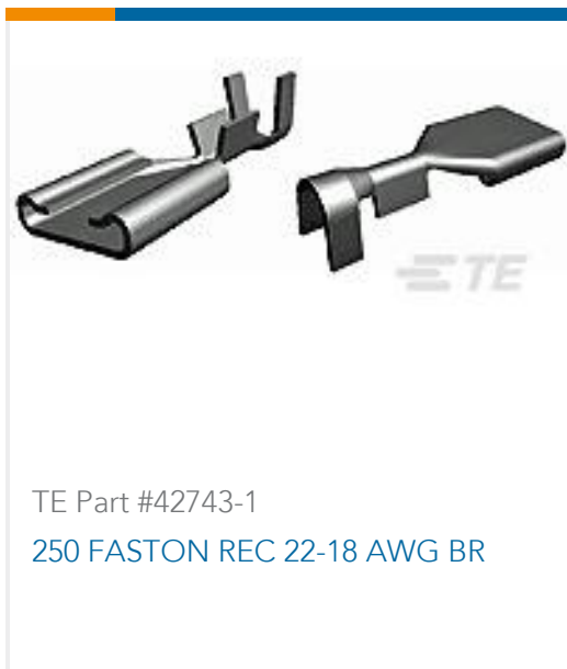
TE Part #42743-1 250 FASTON REC 22-18 AWG BR