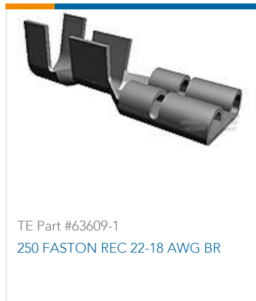
TE Part #63609-1 250 FASTON REC 22-18 AWG BR