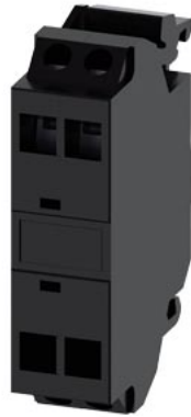
Support terminal, black, spring-type terminal, for front plate mounting