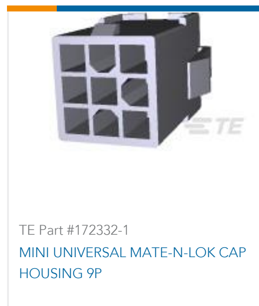
TE Part #172332-1 MINI UNIVERSAL MATE-N-LOK CAP HOUSING 9P