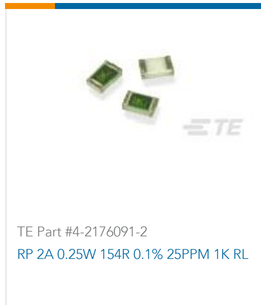
TE Part #4-2176091-2 RP 2A 0.25W 154R 0.1% 25PPM 1K RL