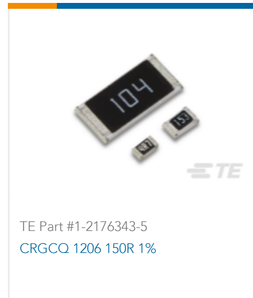
TE Part #1-2176343-5 CRGCQ 1206 150R 1%