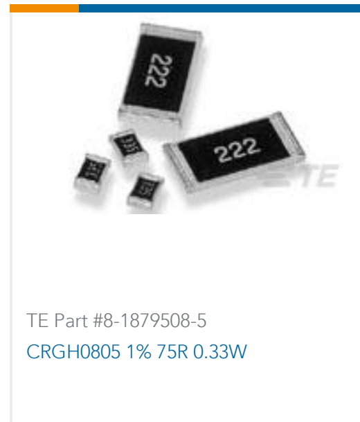
TE Part #8-1879508-5 CRGH0805 1% 75R 0.33W