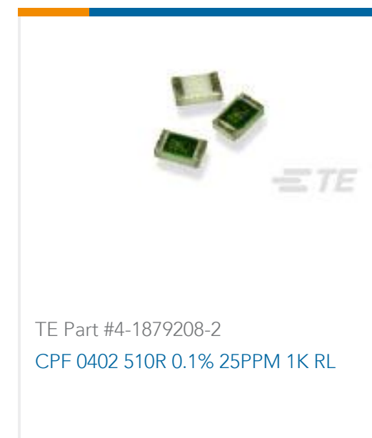
TE Part #4-1879208-2 CPF 0402 510R 0.1% 25PPM 1K RL