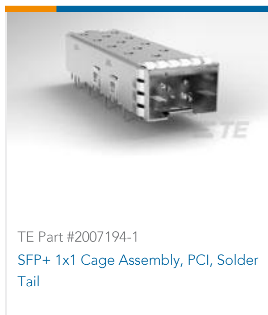
TE Part #2007194-1 SFP+ 1x1 Cage Assembly, PCI, Solder Tail