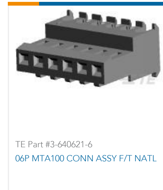
TE Part #3-640621-6 06P MTA100 CONN ASSY F/T NATL