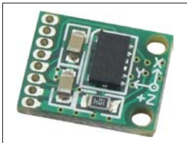
Figure 1: Accel SPI Board

Accel SPI Board is used to measure acceleration and gravity. The measurement on the additional board is performed by using the ADXL345 accelerometer circuit. The additional board is connected to the microcontroller on the development board via pads and communicates with the microcontroller by using serial SPI interface.