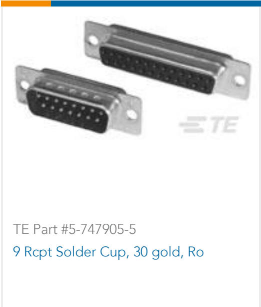
TE Part #5-747905-5 9 Rcpt Solder Cup, 30 gold, Ro