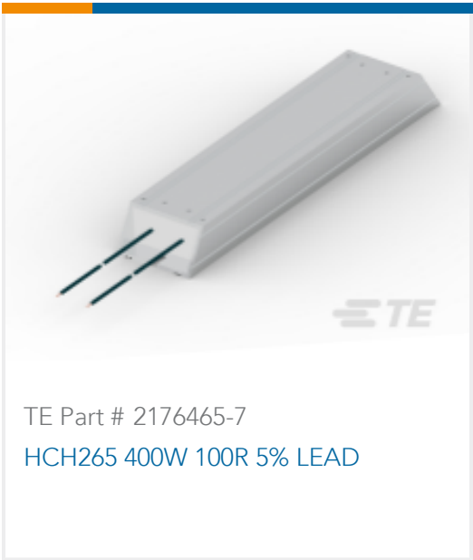
TE Part # 2176465-7 HCH265 400W 100R 5% LEAD