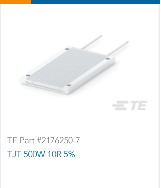
TE Part #2176250-7 TJT 500W 10R 5%