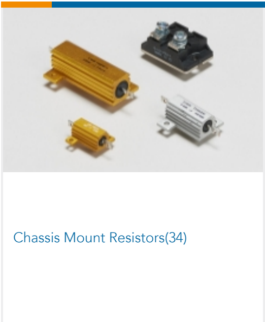
Chassis Mount Resistors(34)