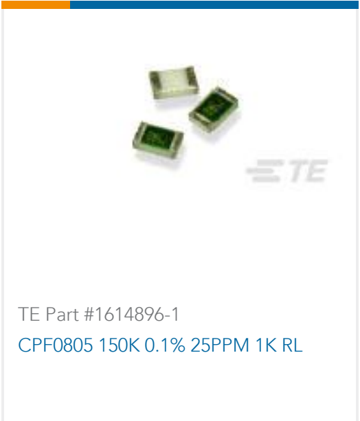
TE Part #1614896-1 CPF0805 150K 0.1% 25PPM 1K RL