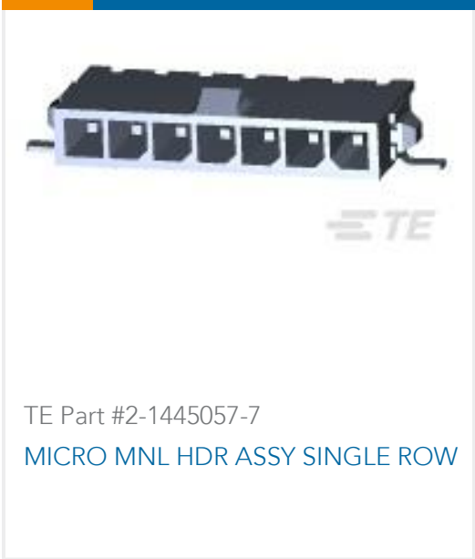
TE Part #2-1445057-7 MICRO MNL HDR ASSY SINGLE ROW