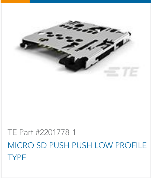
TE Part #2201778-1 MICRO SD PUSH PUSH LOW PROFILE TYPE