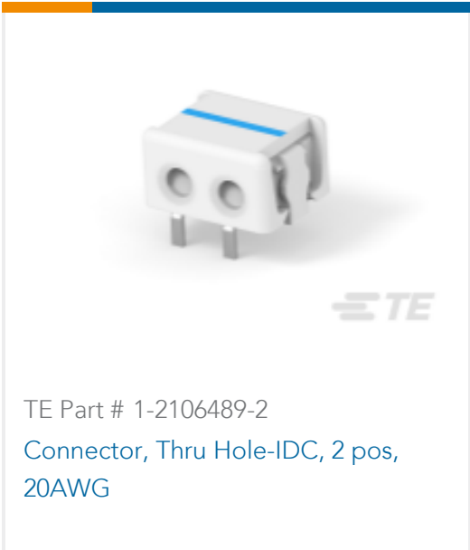
TE Part # 1-2106489-2 Connector, Thru Hole-IDC, 2 pos, 20AWG