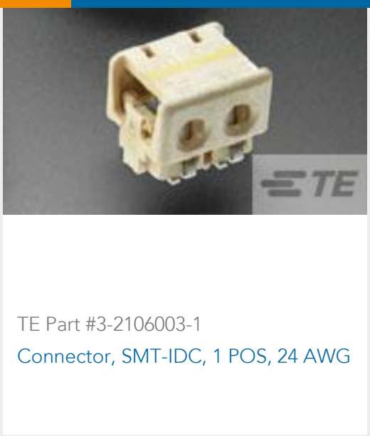
TE Part #3-2106003-1 Connector, SMT-IDC, 1 POS, 24 AWG