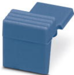
Circular connectors (cable-side), Range of articles: PRC, Accessories, color: blue

Please be informed that the data shown in this PDF Document is generated from our Online Catalog. Please find the complete data in the user's documentation. Our General Terms of Use for Downloads are valid ( http://phoenixcontact.com/download )