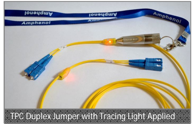
TPC Duplex Jumper with Tracing Light Applied