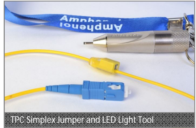
TPC Simplex Jumper and LED Light Tool

The Traceable Patch Cord is targeted toward high density and high congestion areas of the telecommunication fiber optic network. Areas of use spans across the network where passive and active fiber management elements are located. These area can be in the inside plant or outside plant cabinets and closures. Some of the more significant areas to use the TPC product include Data Centers (DC), Central Offices (CO), Mobile Switching Centers (MSC), Telecommunication Closets, Active and Passive Fiber Distribution Hubs (FDH), and Multi-Dwelling Units (MDU).