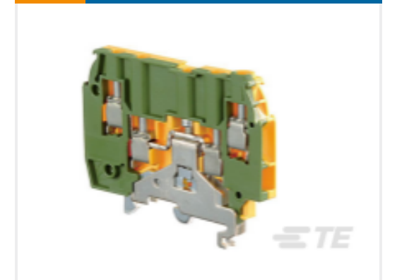
TE Part #1SNA195638R2300 M4/6.4A.P