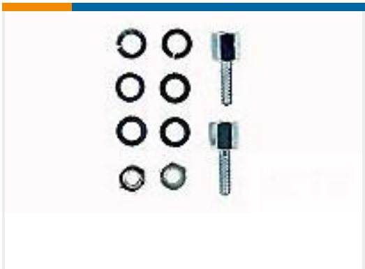
TE Part #5207872-1 KIT SCREWLOCK FEMALE (METRIC)