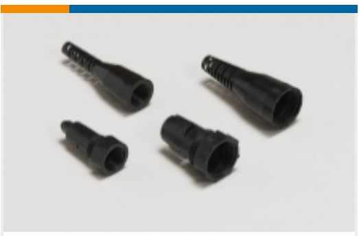
Connector Strain Relief(11)