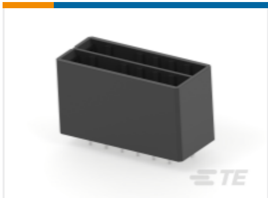
TE Part #2-316132-3 DYNAMIC 3200 HDR ASSY