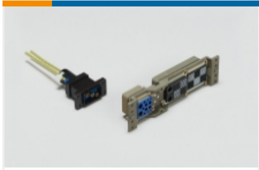
Rack & Panel Connectors(1)