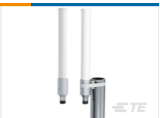
TE Part #OC69271-FNF OMNI,DBAND,FIXED,NF 698-960MHz, 1.5dBi