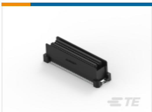
TE Part #6376610-2 MICRO STACK HDR ASSY 80P H=9 WITH TAPE