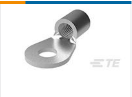
TE Part #36916 TERMINAL,SOLIS R 1/0 5/16