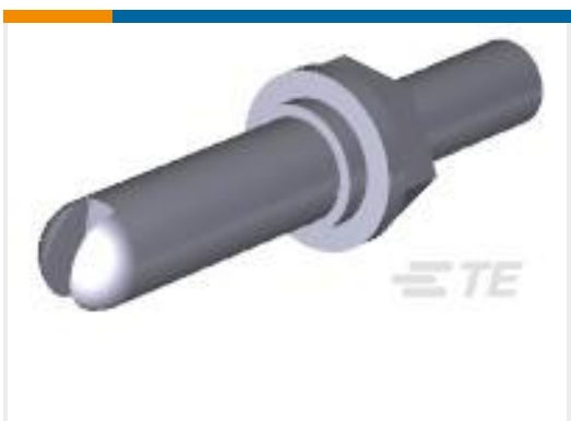
TE Part #1-200833-1 SERIES "M" GUIDE PIN ST. STL.