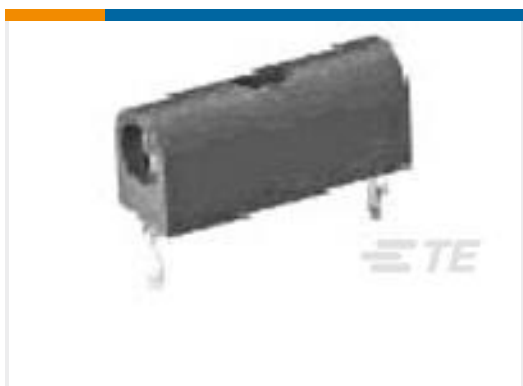
TE Part #3-582118-2 TEST PROBE REC130 BI RED GPBR