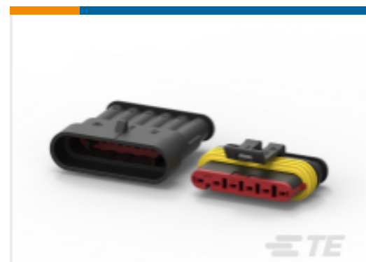
TE Part #282104-1 AMP SUPERSEAL 1.5MM, CONNECTOR HOUSING