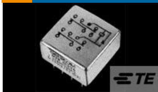
TE Part #1-1617076-1 3SBH1139A2 = M39016/14-002M