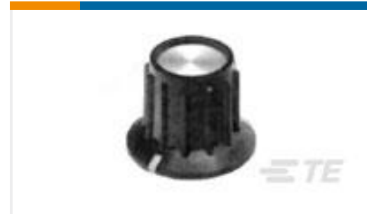
TE Part #1-1437624-1 PKA50B1/8=KNOB PLASTIC 1/8 SHA