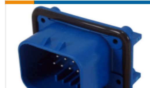
TE Part #776267-5 14POS,PIN DIA 1.3,HDR ASSY,90DEG, COD 5