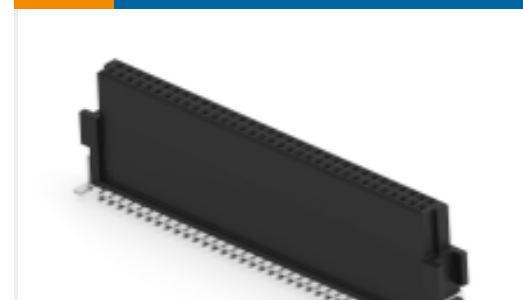
TE Part #234200-E SMCB 68 F AB VV 7-23 CL * H007 137 E002