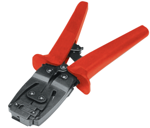
Universal Ferrule Crimper

Replacement Spring Set: 185140008 Handle Spring Set 318001002 Ratchet Spring