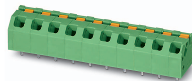
The figure shows 10-pos. standard item (without EX marking)

PCB terminal block, Push-in spring connection