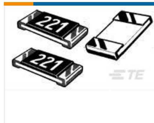
TE Part #1-2176230-1 3522 5R6 5% 3W