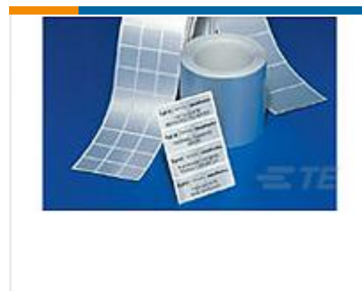
TE Part #C67226-000 HM-254064-10-8A