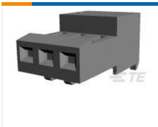
TE Part #3-640441-3 03P MTA100 CONN ASSY WHT