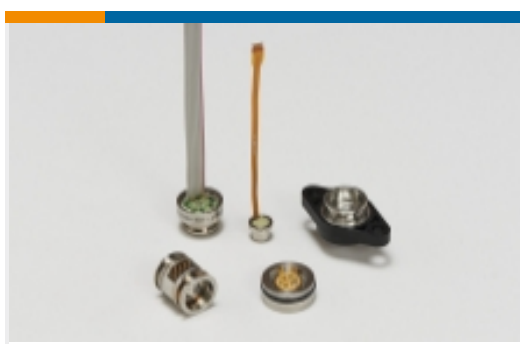
Media Isolated Pressure Sensors(42)