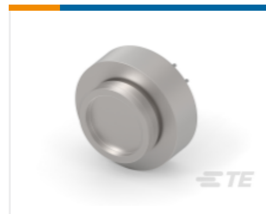
TE Part #87N-1000A-0L MV Pressure Sensor, Uncalibrated, 87NU