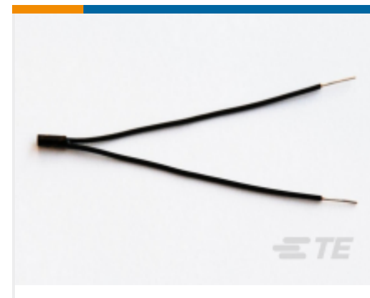
TE Part #GA10K3MBD1 MBD9-PROBE