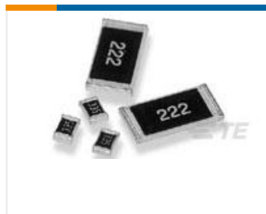
TE Part #3-1879501-1 CRGH2512 5% 18R 2W