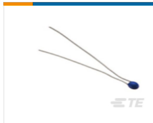
TE Part #GA50K6A1A DISCRETE 50K OHMS,+/-0.1C FROM 0C TO 70C