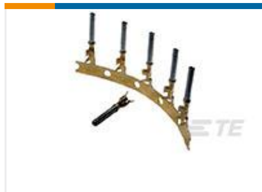
TE Part #1062-20-0144 SOC, SF, SIZE 20, 16-22, AU/SN