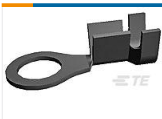
TE Part #1-1627187-3 H430ET/R2500