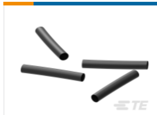
TE Part #EK5194-000 ES2000-NO.6-H2-0-39MM