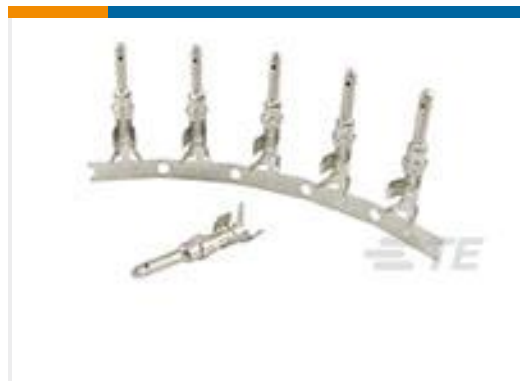
TE Part #1060-12-0222 PIN, SF, SIZE 12, 10, NI/NI