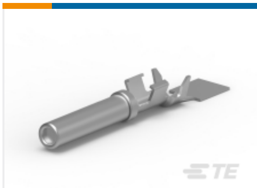
TE Part #1060-14-0122 DEUTSCH Size 16 Crimp Contacts