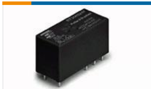
TE Part #2-1419108-6 RTB14024F