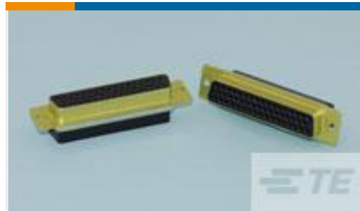
TE Part #1658640-2 RECP. ASSEMBLY SIZE 5