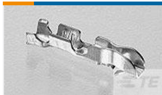
TE Part #170262-1 EIS CONTACT