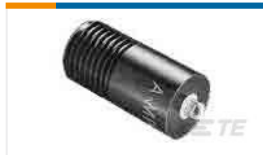
TE Part #834333-2 RECEPTACLE