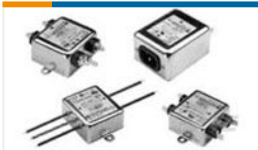
TE Part #1-6609028-9 20VK6=F7357 S0