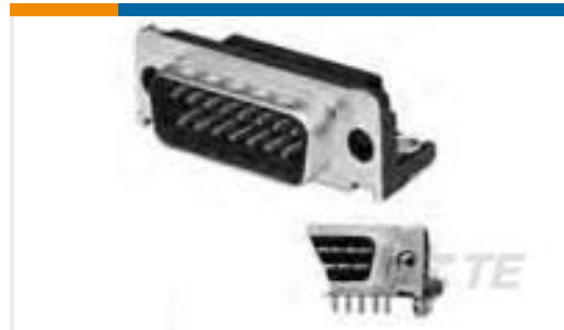
TE Part #5747843-3 37 MSFL PLUG RA 318 (IN,FM,BL)