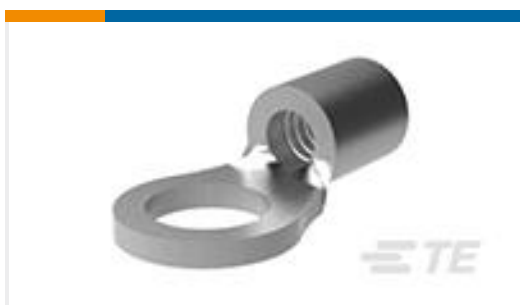
TE Part #34104 SOLIS R 22-16 COMM 22-18 MIL 4