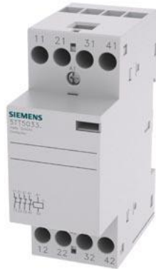
INSTA contactor with 4 NC contacts Contact for 230 V AC, 400V 25A Control 24 V AC